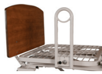
Pivoting Assist Bars