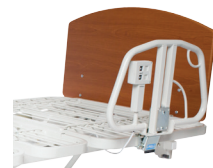
1/4 Length Side Rail with or without Fixed Handset