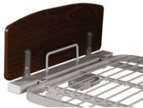
4" Bed Extender