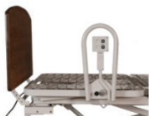
Pivoting Assist Bars with Fixed Handset