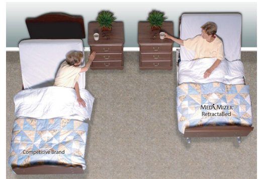
Fall Risk Non-Retractable Bed