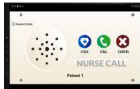
Nurse Call Interface