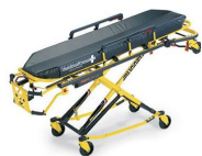
Stryker MX-PRO Ambulance Cot BS047407