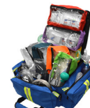
SimLabSolutions Loaded Training Pediatric Jump Bag™ LC129913