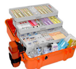
SimLabSolutions Loaded Simulated Medication Box LC129910