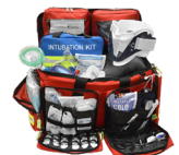
SimLabSolutions Loaded Training ALS Jump Bag™ LC129911